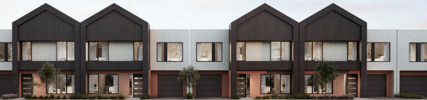
Image is for illustrative purposes only and may depict upgrade options and other items not supplied by Creation Homes.